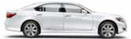
LS 600h / LS 600h L Full Hybrid Luxury Sedan