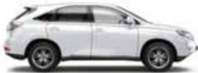
RX 450h Full Hybrid Crossover