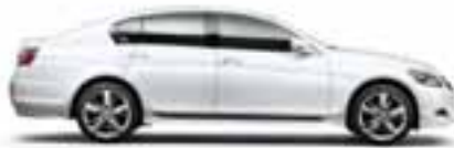
GS 450h Full Hybrid Performance Sedan